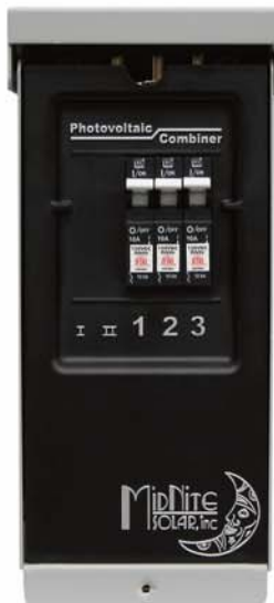
Configured for 150VDC breakers (Gridtie)