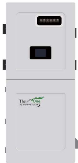
The MidNite MN15-12KW-AIO

As a side note, you will notice MidNite uses CBI breakers throughout this AIO inverter. CBI breakers (made in South Africa) are 100% duty cycle rated. All the other AIO inverters use inexpensive thermal breakers and can only be used to 80% of their rating. So are they really 200 amps? No, they are only good for 160 amps continuous. Our circuits are rated to be used at the full 100 amps continuous. After having supplied millions and millions of these breakers over the past 23 years, it is great to honestly say there have been less than a couple hundred failures. All of those were covered under warranty regardless of when they were purchased.